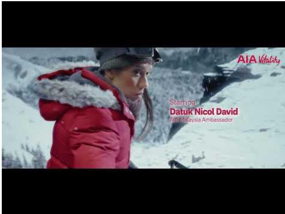
AIA Malaysia Ambassador, Datuk Nicol David stars in AIA's Subscribe to A Better Life Campaign Click to watch the brand film

The campaign is a creative expression of AIA's intention to empower Malaysians to embrace a better life – one that is healthy, active and vibrant. Tapping into Malaysians' familiarity and love for on-demand streaming platforms, AIA was inspired to build a brand story that resonates with the everyday-joe by presenting its solutions and offerings as movies and tv shows that are personalised to their profiles.